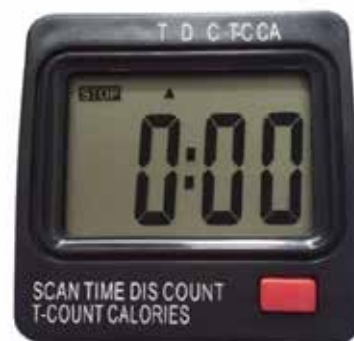
Display shows TIME

Accumulates the number of movements made by cycling during training session.